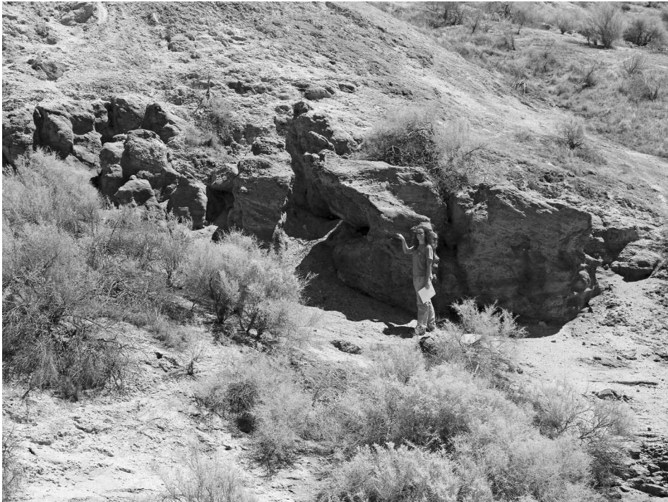
Figure 1 Outcrop of the Tulare Formation in the near vicinity of the Asphalto paleontological locality, UCMF 1365. The outcrop consists of well-sorted sands saturated with oil. View is to the southeast. Author K. Brown for scale.

E. occidentalis . VPM 9129 is the left P3 from Tuolumne County, selected by Gidley (1901) as the lectotype; this specimen is not considered further here. VPM 9130 is the right P3 “obtained from a bed of asphaltum, in company with a last lower molar , near [Buena] Vista Lake” (Leidy, 1865:94; emphasis added).