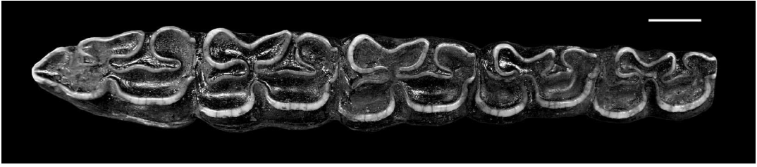
Figure 5 VPM 9141, left lower cheek tooth row with p2 through m2, occlusal view. Anterior is to the left. These teeth are from material mentioned by Leidy (1869, 1873) and Whitney (1880) as Equus occidentalis from the same locality yielding the original type series. This specimen has not previously been figured. The molars (right two teeth) exhibit broad, rounded linguaflexids and shortened ectoflexids. Scale = 1 cm.

approximately two miles to the southwest of McKittrick.” (Schultz, 1937:5)