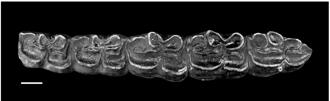
Figure 4 VPM 9144, right lower cheek tooth row with p2 through m2, occlusal view. Anterior is to the right. These teeth are part of a partial mandible mentioned by Leidy (1869, 1873) and Whitney (1880) as belonging to Equus occidentalis and deriving from the same locality yielding the original type series. This specimen has not previously been figured. The molars (left two teeth) lack any plesippine characters but, instead, exhibit broad, rounded linguaflexids and shortened ectoflexids. Scale = 1 cm.

“The first mention of vertebrate remains from the McKittrick region seems to have been made by Joseph Leidy (1865, p. 94), who described two horse teeth from the vicinity of Buena Vista Lake and referred them to Equus occidentalis [ underlined in original ]. Additional horse material from this locality was described and figured by Leidy in 1873 (pp. 242–244, pl. 33, fig. 1). Whitney (1880, p. 256) stated that Leidy’s specimens were obtained from Santa Maria Oil Springs, a locality